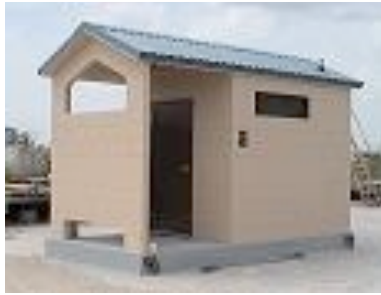
Exterior split block reveal and metal roof, as shown, are optional.

ADA-Compliant, Single-Room Restroom Building With One Flush Toilet, One Sink and a Privacy Screen