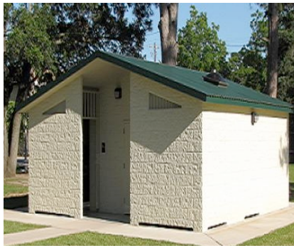
Exterior split block reveal and metal roof, as shown, are optional

ADA-Compliant, Two-Room Restroom Building with Four Flush Toilets, Two Sinks and a Privacy Porch