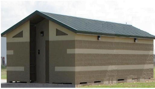
Exterior split block reveal and metal roof, as shown, are optional

ADA-Compliant, Two-Room Restroom Building with Six Flush Toilets, Two Urinals, Four Sinks and a Privacy Porch